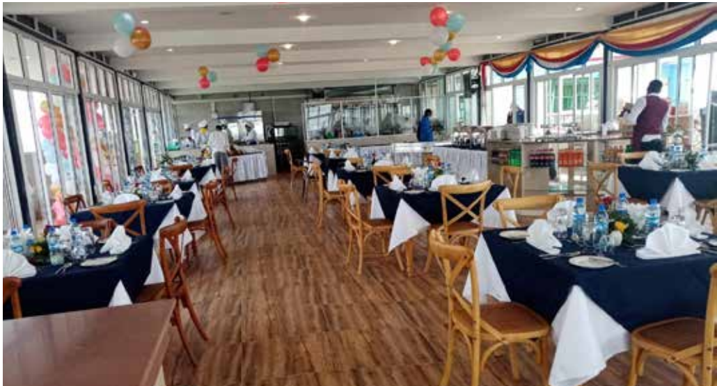
Hospitality students taking their practical classes in our modern Rooftop restaurant.