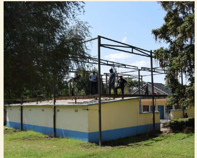
The new accommodation facility being put up at the MKU hostels