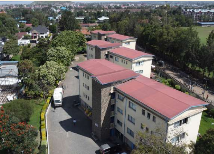
Nakuru Campus Hostel Aerial View