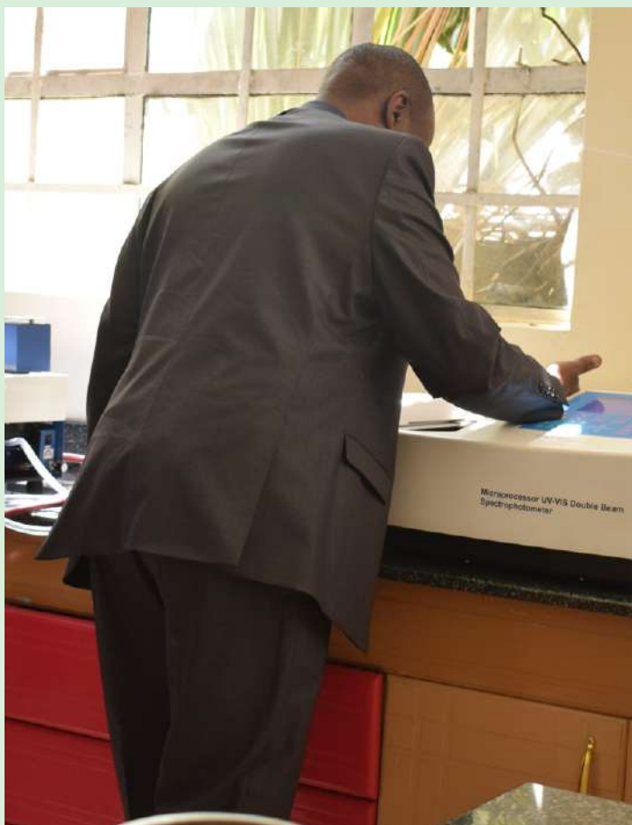
Vice-Chancellor, Prof. Deogratius JAGANYI inspects the newly installed lab equipment inside the science labs in Nakuru campus during the launch