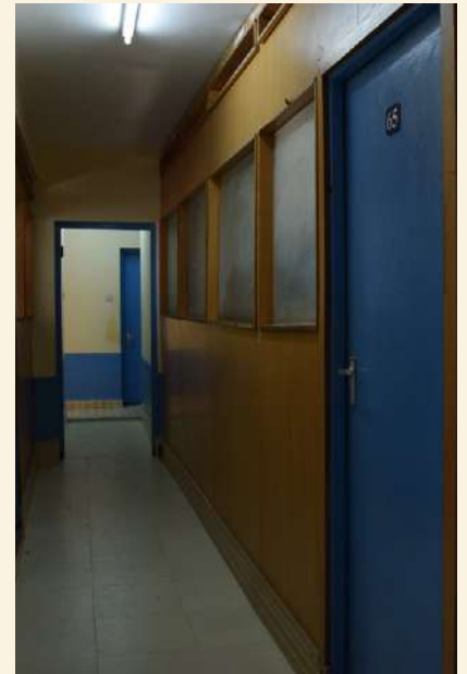
Inside the hostels corridors