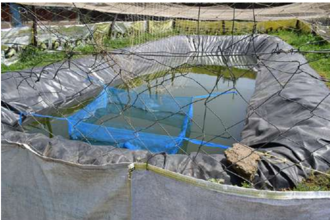
A fish pond in the Nakuru Campus Demo farm