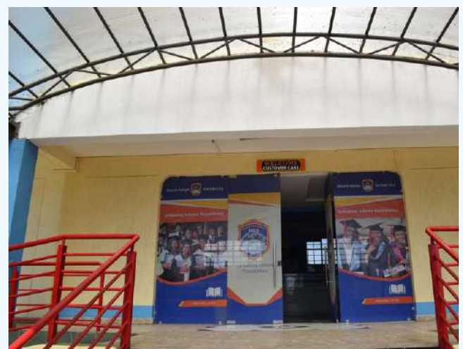
Customer care office entrance