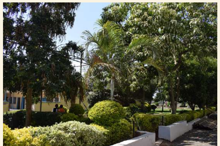
The serene environment in which the MKU hostels are located