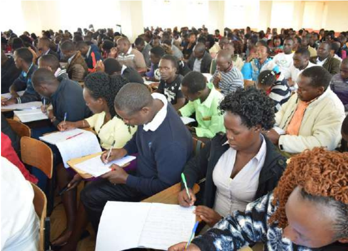
School of Education; a DIBeL class in progress