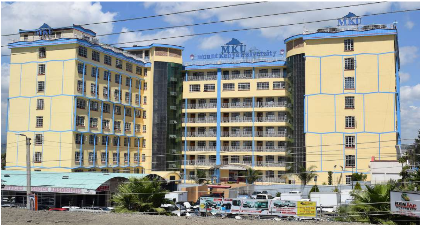
The Great Rift Plaza, magnificent building that hosts MKU Nakuru Campus