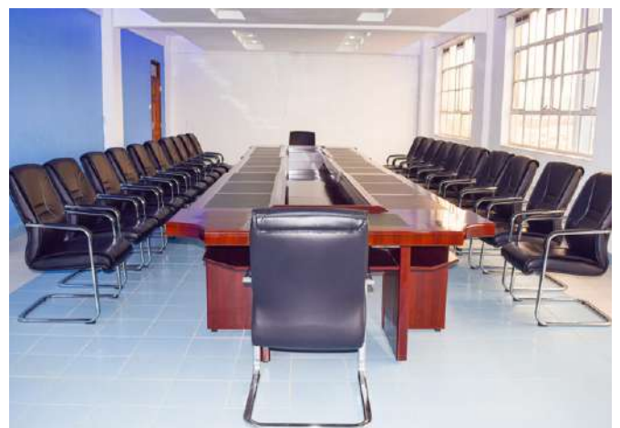
Director's Boardroom in Nakuru campus