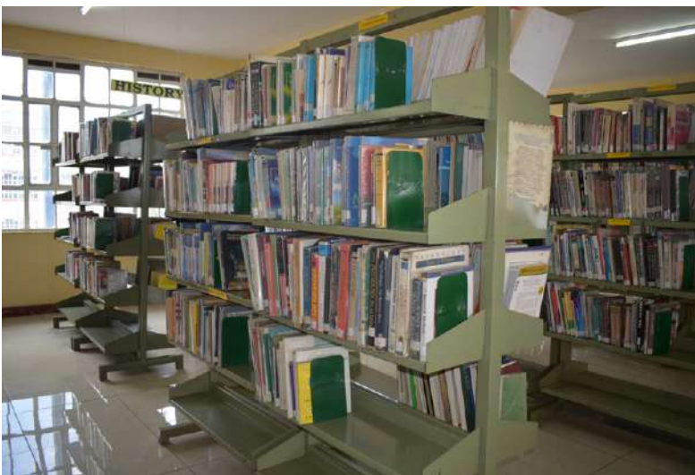
Books inside the library in Nakuru campus are neatly arranged and are easy to retrieve