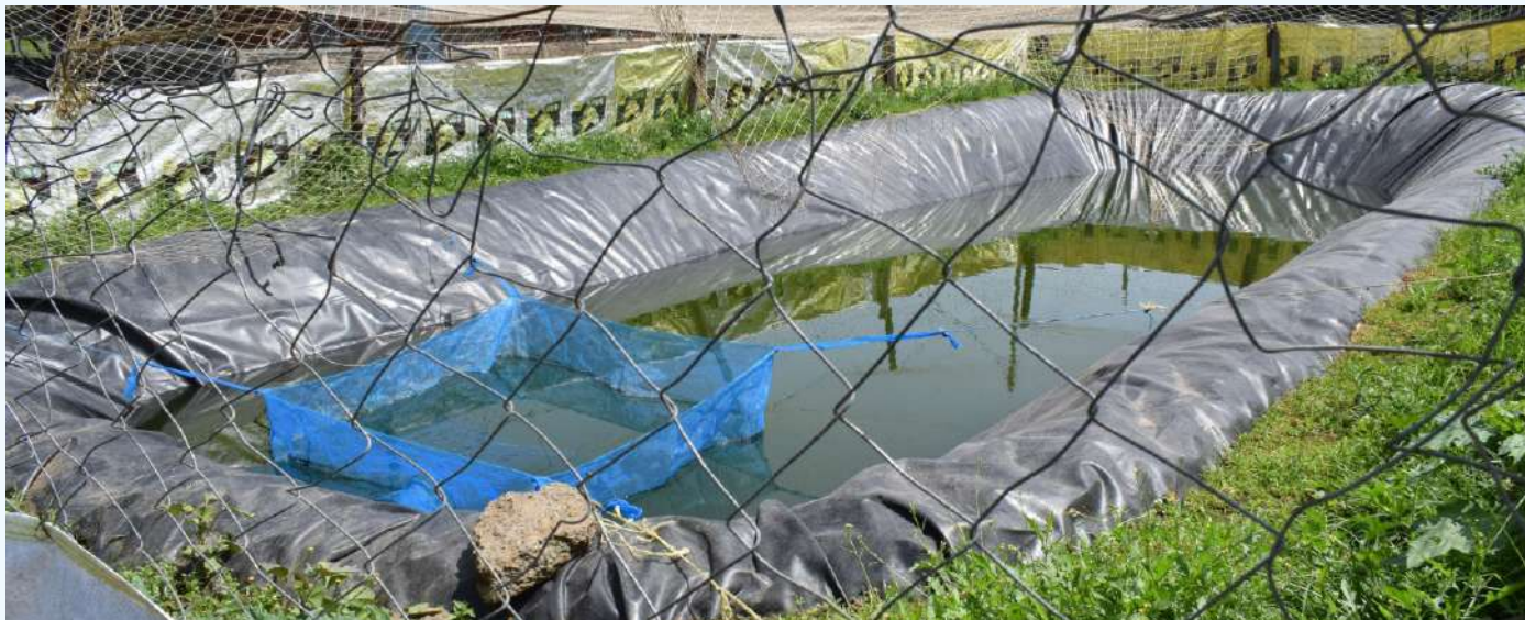
A fish pond inside the Mount Kenya University demonstration farm at the ASK showground Nakuru

The farm is a model foundation of knowledge. There is a greenhouse in which different types of crops are grown. Students are taught both basic and scientific procedures in agriculture using the sample plants inside the green house. These students are so well equipped with information that they sometimes step in to offer consultation services to farmers in the neighbourhood.