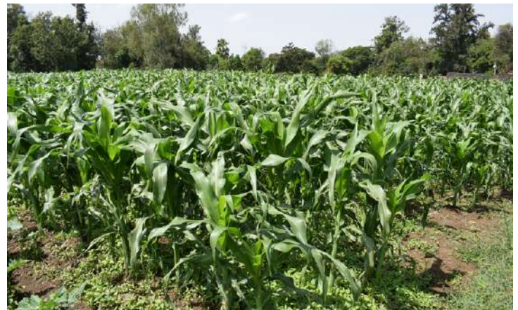
A maize plantation at the Nakuru ASK show demo farm