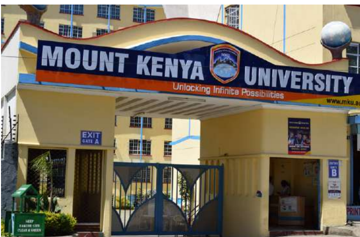
The entrance to Mount Kenya University Nakuru Campus