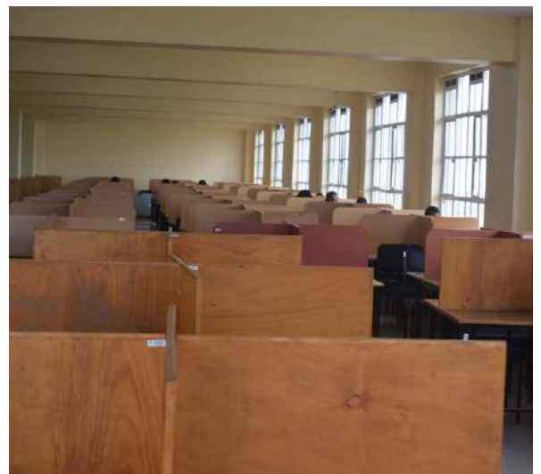
The reading area in the library in Nakuru campus is spacious and well aerated