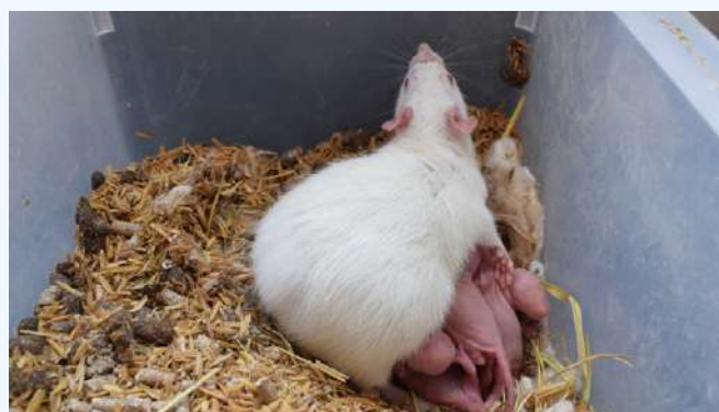
A mouse with its pups inside the science laboratory in Nakuru Campus

analysis, immunization and postmortem among others. Animal feeds are analyzed from the science labs at the basement and fed to the animals in their respective proportions.