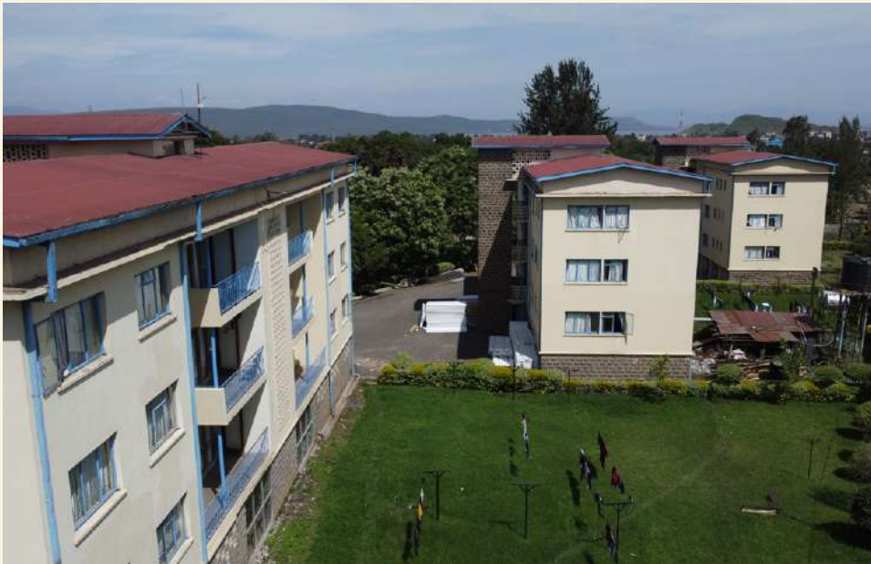
Clothing lines as seen from an aerial angle are located in a secure area inside the hostels