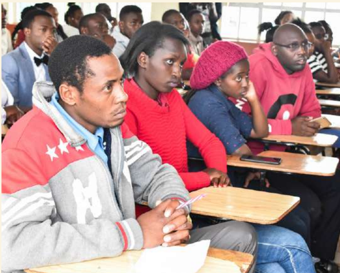
Journalism students get an opportunity to interact with staff from TV47 during a mentorship session. The HOD for Journalis Department was in attendance