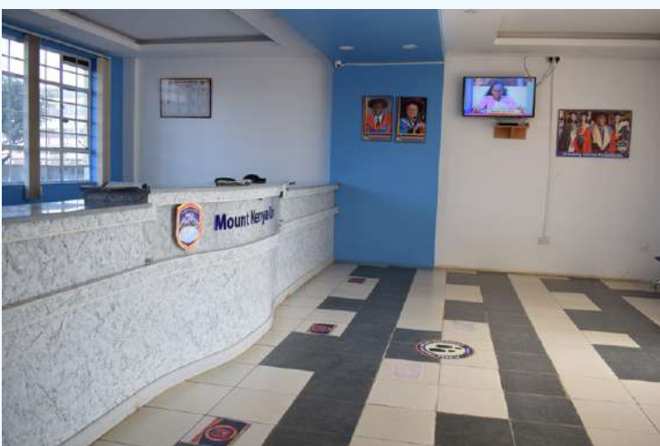
Nakuru Campus Customer care office