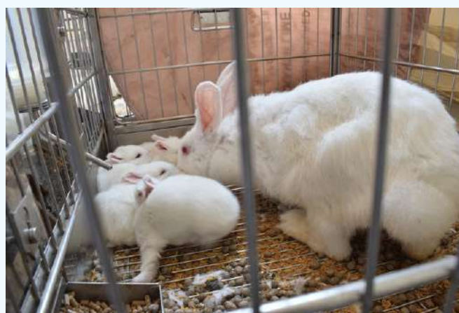
Laboratory animals used for scientific research and training in Nakuru campus