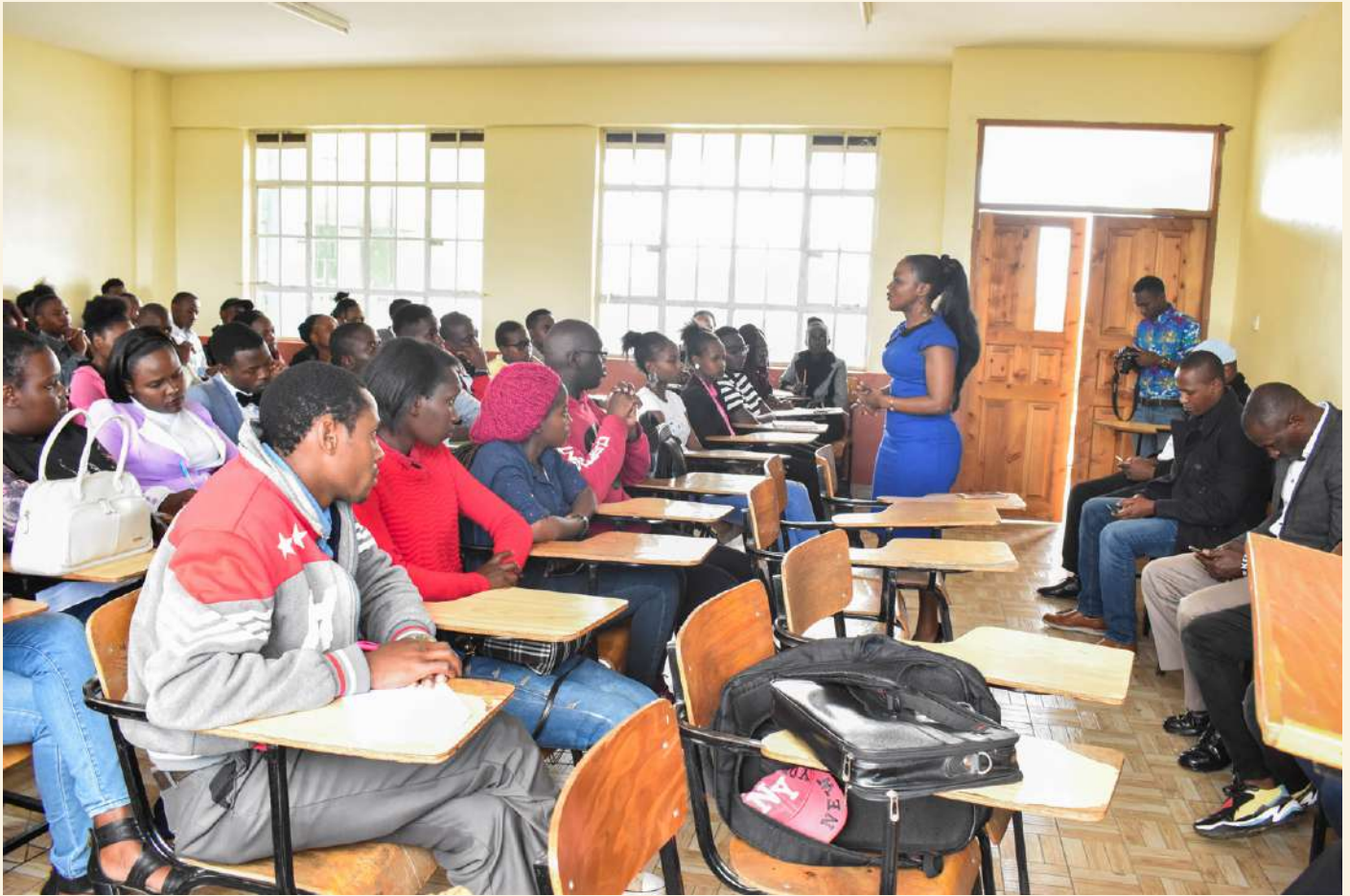
Students from the department of Journalism keenly follow proceedings during a mentorship session conducted by staff from TV47