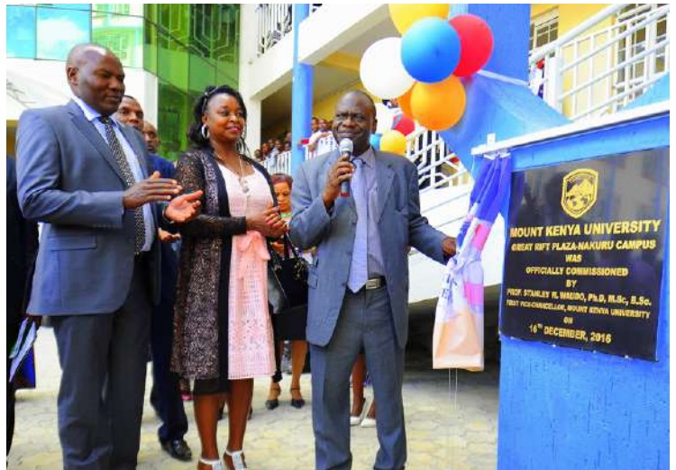
Nakuru campus Launch